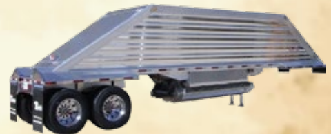
ALUMINUM BOTTOM DUMP