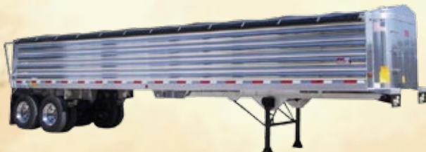
END DUMPS (frameless, -quarter-frame, frame-type)