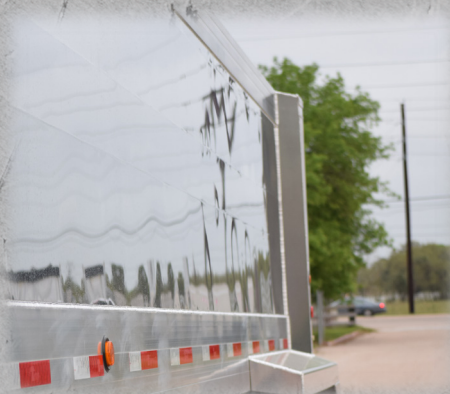
Outside Rear Post to Eliminate Neck Down