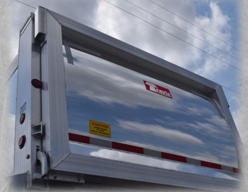
Single Piece Curved Tailgate to provide ADDED Strength