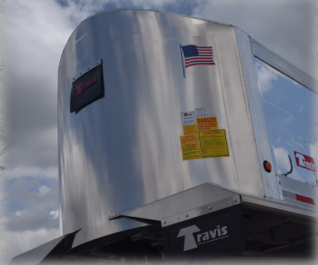
Aerodynamic Round Nose